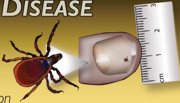
measured on a thumb, the nymph is 2mm