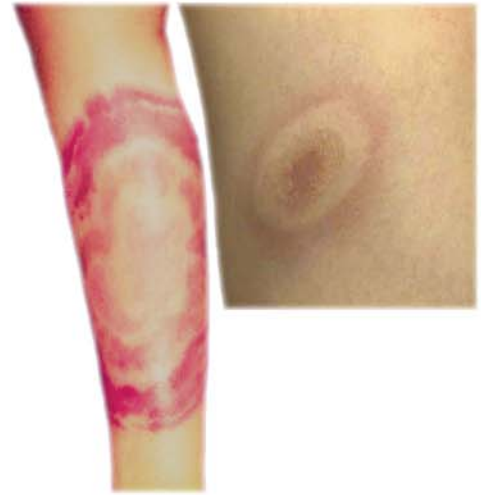
(above right): the back shows early symptoms of lyme disease, while the arm (left above) shows the disease at well developed stage.

Apart from erythema migrans none of the symptoms is unique to Lyme disease, which may make diagnosis difficult.