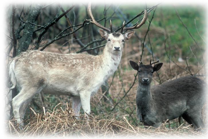
Third year buck "sorel", right, with older buck

Females are polyoestrous (will come into season repeatedly if they do not conceive at first). This may result in occasional births as late as September rather than June/July. Adult doe pregnancy rate is often 90% or more. Does produce a single fawn every year over a breeding life of 10 years or more. Late middle aged does are generally larger and may produce heavier, earlier fawns. Twin fawns have been recorded but does will occasionally suckle young from other does making it appear that they have twins. Does may conceive as yearlings but