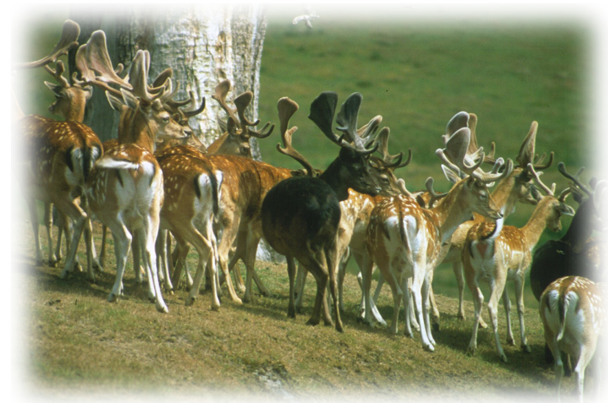
Fallow are variable in colour, bucks in velvet

Size and form of antlers is some indicator of age in fallow, prickets (yearlings) having simple spikes or knobs. Brow and trey tines typically develop in the second head (sorels) and palmation begins at some time then or later. The antlers of very old bucks may decline in size. In general the pedicles will be shorter on older bucks.