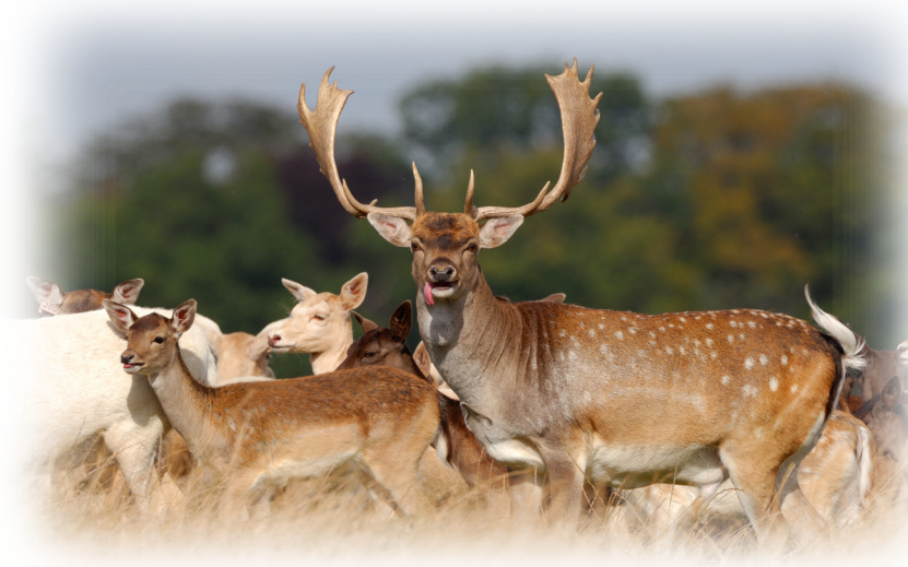
Buck and does during rut

Fallow deer movement is affected by time of day, season and weather, some knowledge of how they respond will make them easier to predict, see Deer Behaviour guide.