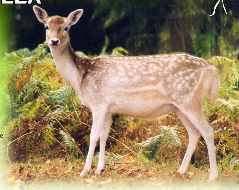
Menil coloured doe

The aim of this guide is to highlight features of the biology and behaviour of Fallow deer (Dama dama) as an aid to the management of the species, it is not a complete description of Fallow deer ecology (see Further information below). Deer behaviour is not fixed, they will adapt their behaviour to local circumstances, sometimes behaving quite differently from one area to another or over time. This guide links to Deer Biology, Deer Behaviour and Deer Signs guides which should be considered as important associated reading.