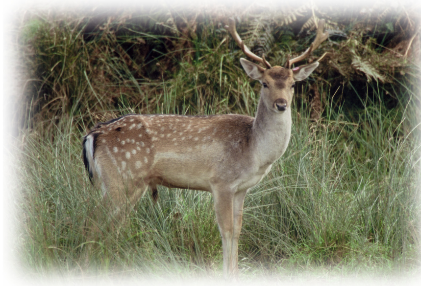
penile tuft is obvious in male, young common coloured buck coming into winter coat

Well known for making tracks through, and sitting in, standing cereal crops, which can open crops out to wind-blow. Bucks may cause serious damage by fraying and thrashing trees and shrubs, especially in areas where they are resident and during the rut.